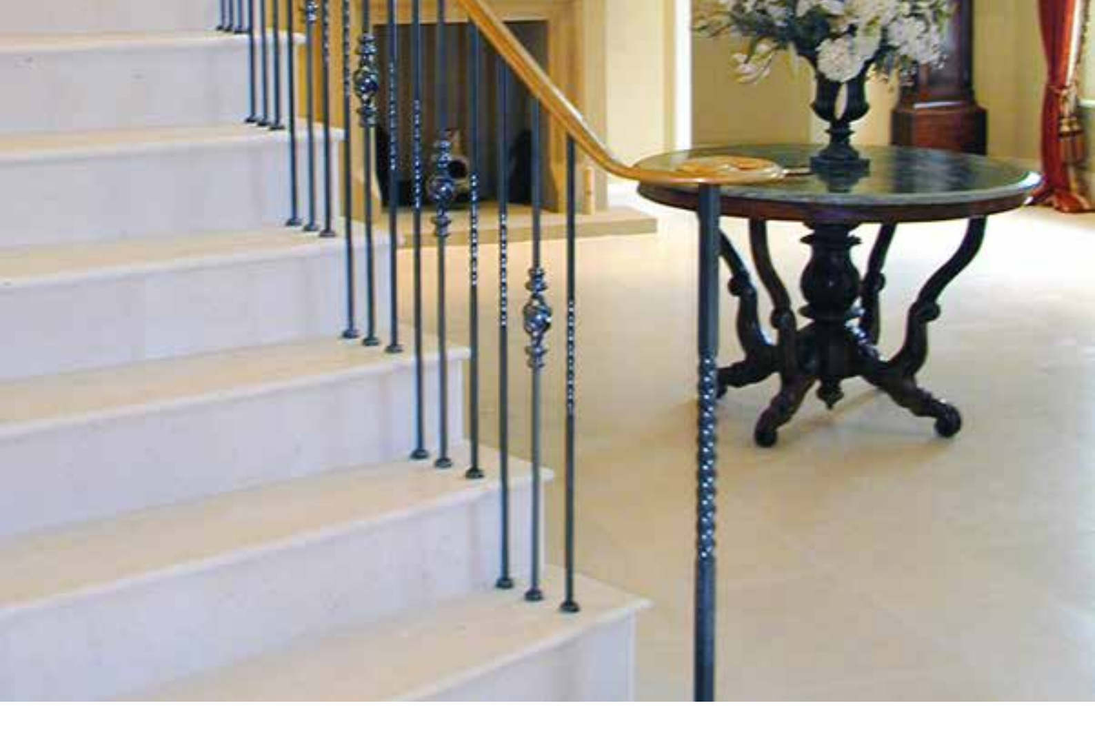
White Limestone is made of a structure which is the root of many other crystals.